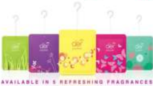
AVAILABLE IN 5 REFRESHING FRAGRANCES