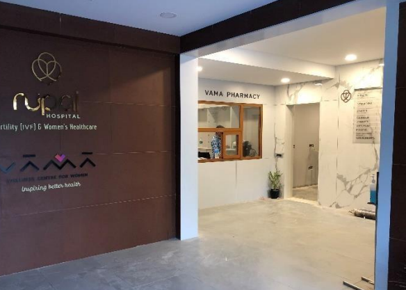
Rupal Hospital / Surat / 10,000 sq.ft. / 2019 IGBC registered for Green New Interiors

Diamond Factory for Laxmi Gems / Surat / 25,000 Sq Ft / 2020 IGBC registered for Green Existing Interiors