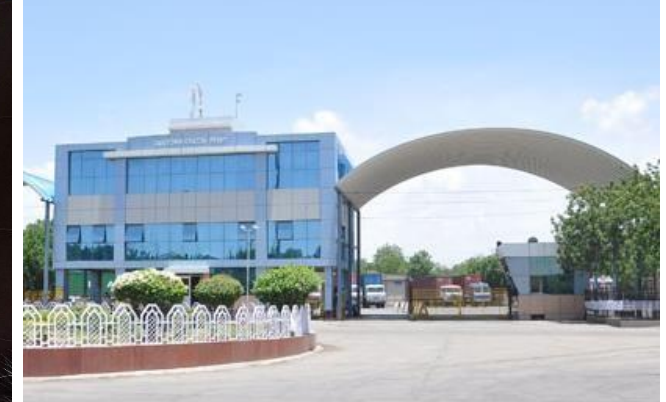
Kandla Special Economic Zone / Gandhidham / 1000 acres / 2021 IGBC Registered for Green Industrial City