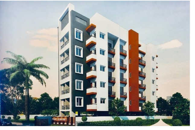
Sugat Residency / Surat / 15,600 sq.ft. IGBC registered for Green Affordable Housing Category