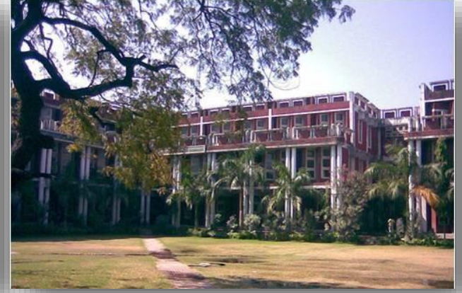
Sarvajanik College of Engineering & Technology / Surat / 3,00,000 Sq Ft / 2018 IGBC Registered for Existing Building Category

Diamond Factory for Shairu Gems Pvt. Ltd. / Surat / 80,000 sq.ft. / 2018 IGBC Net Zero Rated Building – 1<sup>st</sup> in Gujarat and 3<sup>rd</sup> in India