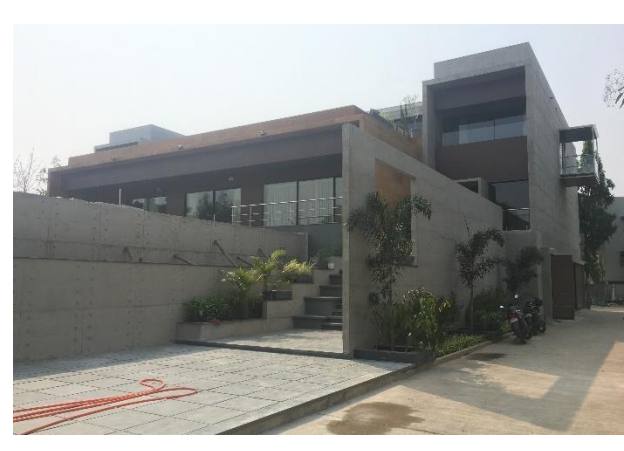
Nirant Residence/ Surat / 12,800 sq.ft. IGBC Platinum Rated Green Home – 75/75 points achieved – Greenest House in Gujarat – 2<sup>nd</sup> Greenest House in India