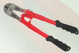
Taparia Bolt Cutter