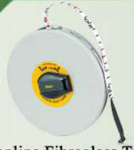
Topline Fibreglass Tape

Steel Tape Rules, Dip Tapes, High Precision Spirit Levels