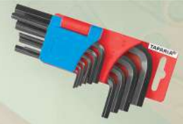
Allen Key Set