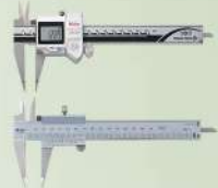
Mitutoyo Point Caliper