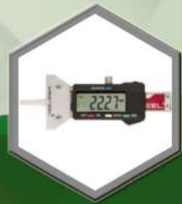
Digital Tyre Depth Gauge