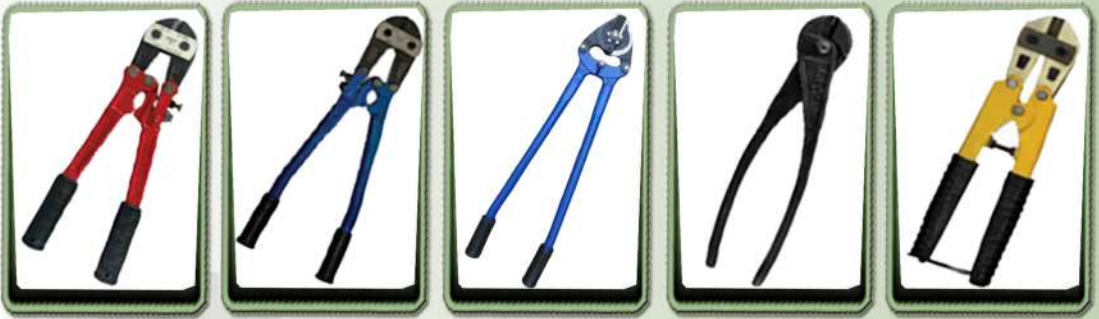
12" H.T. Bolt Cutter 18" G.C. Bolt Cutter 30" Cable Cutter CC Type 12" Wire Cutter 8" Pocket Cutter